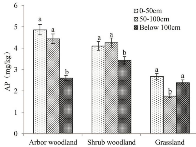
Fig. 3. Soil available P content in different land use types.