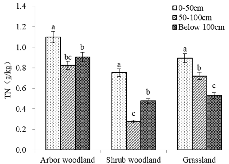
Fig. 2. Soil total nitrogen content in different land use types.

phosphorus and available potassium, and the correlation coefficient was between 0.54 and 0.94, and the correlation was more than 0.01 confidence test. This indicated that there was a synchronous increase in organic matter, total nitrogen, available phosphorus and available potassium during the improvement of soil nutrients. Organic matter was significantly correlated with total nitrogen, available phosphorus and available potassium, which was consistent with other research results. Organic matter was the key indicator to characterize soil quality in hilly areas of the Loess Plateau (Xu and Liu 2004). With the increase of soil nutrients, soil pH showed a downward trend, which was related to the gradual improvement of soil alkaline environment that was not conducive to plant growth in the process of soil improvement by vegetation and human transformation. It was also found that there was no significant correlation between available phosphorus, total nitrogen, and available potassium, as well as with other indicators, and it had good independence.